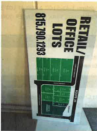
Sager Advertising Sign.jpg